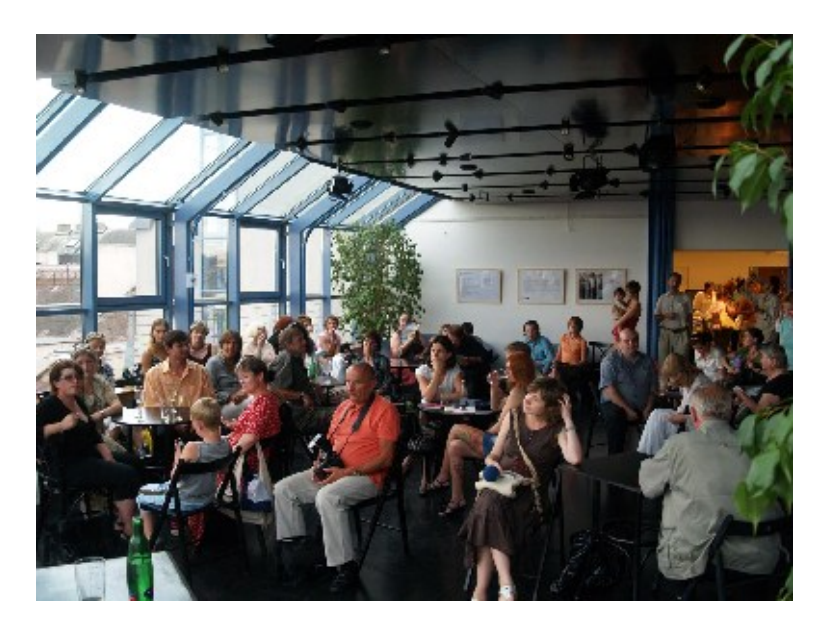
Exhibition and Competition Women Friendly Party

Like last year, we also collected some interesting research through public opinion polls concerning women in politics and their institutional support, quota for women in politics and women's chances to play a rolein decision-making. The researche clearly demonstrates that the views of the Czech public on these issues are changing in favour of women and their more representative participation in politics.