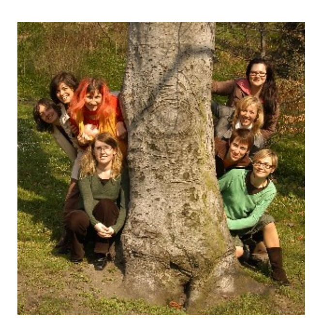
Fórum 50 %, spring 2007